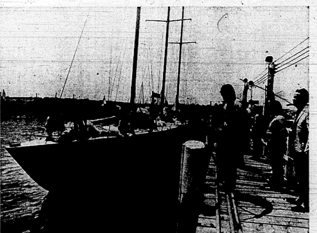
Securing the Lines: Vendredi 13 being warped into dock at Newport yesterday after second-place finish in transatlantic race. The 128-foot schooner is the largest vessel ever to sail in arduous event.