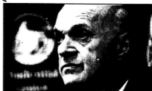
Lou Lamoriello has helped the New Jersey Devils win three Stanley Cups during his tenure with the team.