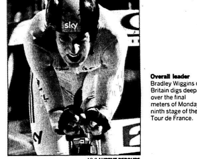
Overall leader Bradley Wiggins of Britain digs deep over the final meters of Monday's ninth stage of the Tour de France.